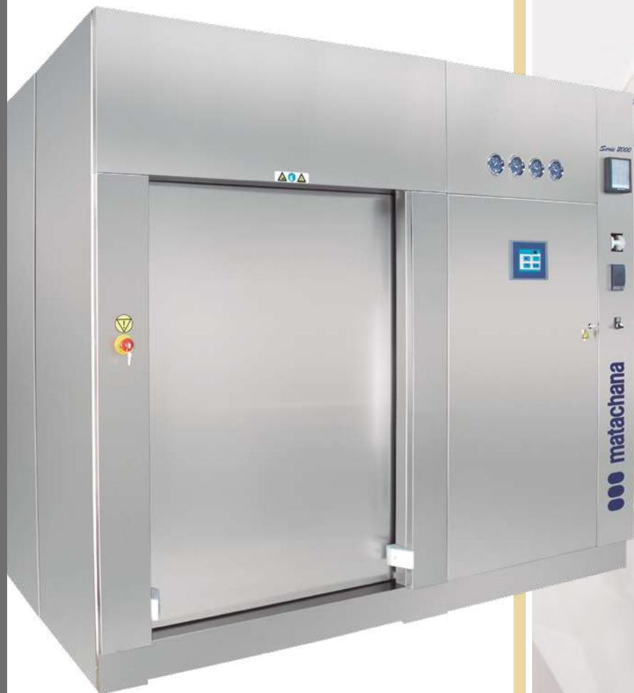
Steam sterilizers Matachana 2000 I